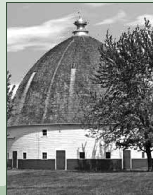
Home of the Round Barn Plymouth County Fairgrounds, Le Mars, IA

- Board of Directors, Plymouth County 4-H and Agricultural Society